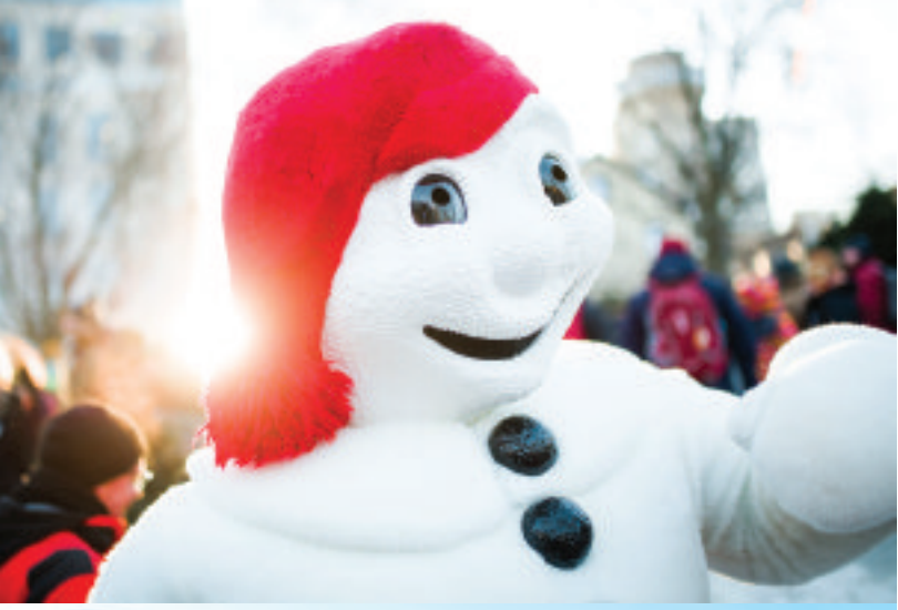
Scenes from Quebec Winter Carnival.