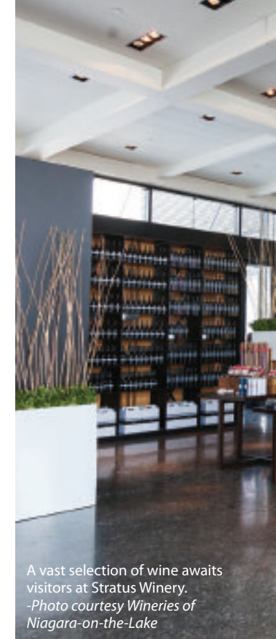
118 | Sideroads of Caledon, Dufferin & King | FALL 2019