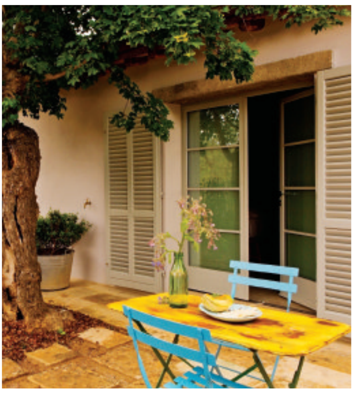
Villa Reniella's decor can be described as "rustic chic, slightly industrial; with walls that are two feet thick."