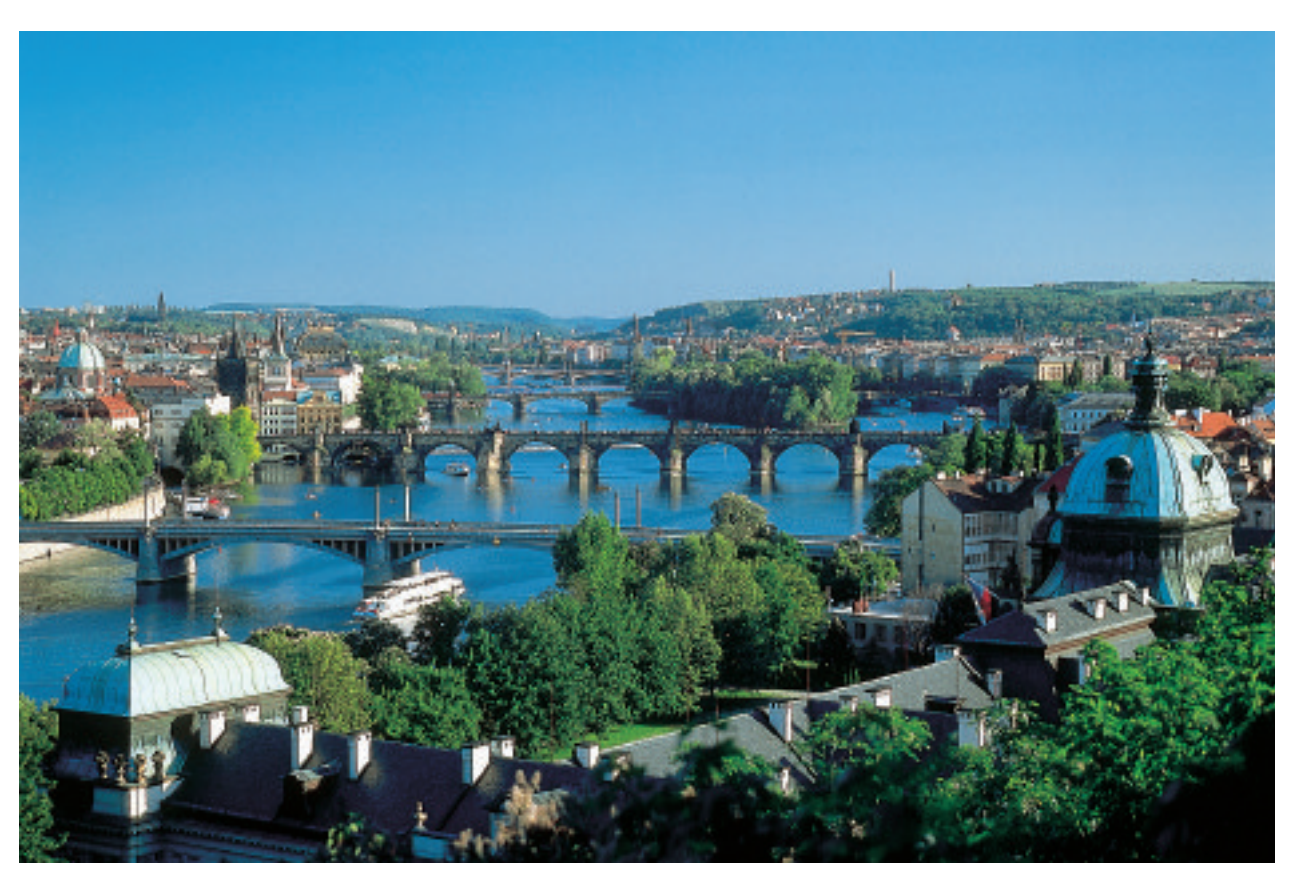
The Odin passing under some of the bridges in Prague

Years' War and later rebuilt, but never completely finished due to being damaged by lightning in 1764. The castle was abandoned over 300 years ago, yet today visitors on mass tour the ruins and marvel over the world's largest wine barrel which once held 50,000 gallons of wine. A walking tour through Heidelberg was a highlight due to its cobblestone streets and abundance of half-timbered houses and baroque buildings in the historic Old Town.