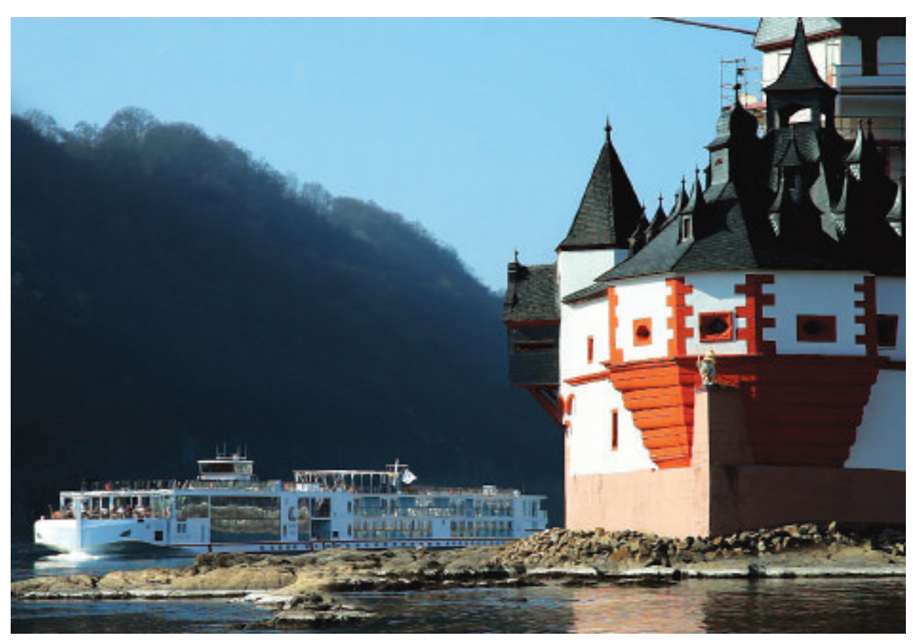
The Viking Odin on the Rhine by the Pfalzgrafenstein Castle in Germany