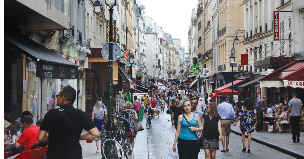
The Eiffel Tower (above) and Bourse street scene (2nd Arrondissement, right bank, Paris Opéra area).