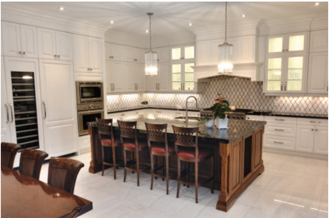
7,000 square feet on two levels with an additional 4,000 feet of living space on the lower level. Large outdoor fireplace and living room area. Putting green, custom built-in bar, games room, two-tier theatre room, gym, powder room, elevator, two laundry rooms, main floor office, three car garage with lift, state-of-the art security and heating systems, two master bedrooms with ensuites, oval tub with crystal chandelier (over top) and walk-in shower.