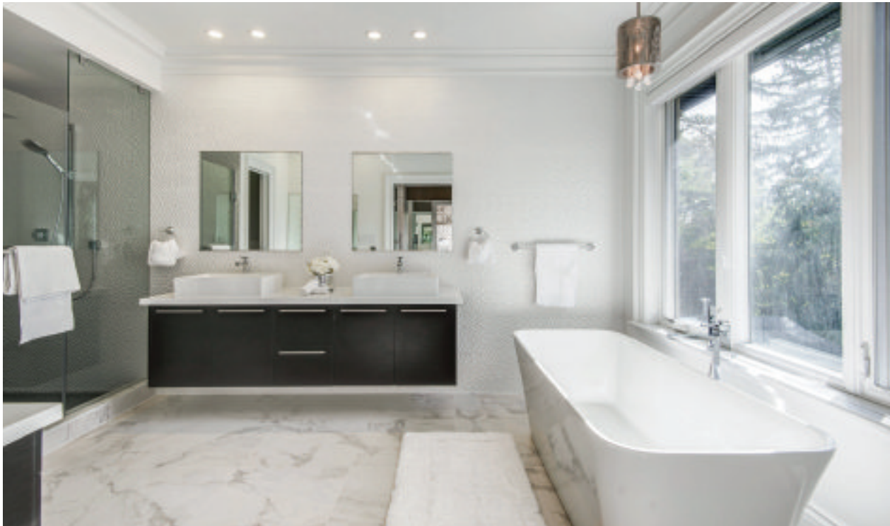
Address: 2086 Autumn Breeze Drive, Mississauga. Designer: David Small. Size: 8,000 square feet living space, 7 bedrooms, 6 bathrooms, Palladium windows, French doors, Juliette balconies, mahogany double entry doors, kitchen quartz countertops, butler's pantry, stainless steel ovens, fridge/freezer, home office, three-car garage, party room, game room, gym, separate entrance for nanny suite. Price: Listed at $4, 498, 000 (price at time of publication).