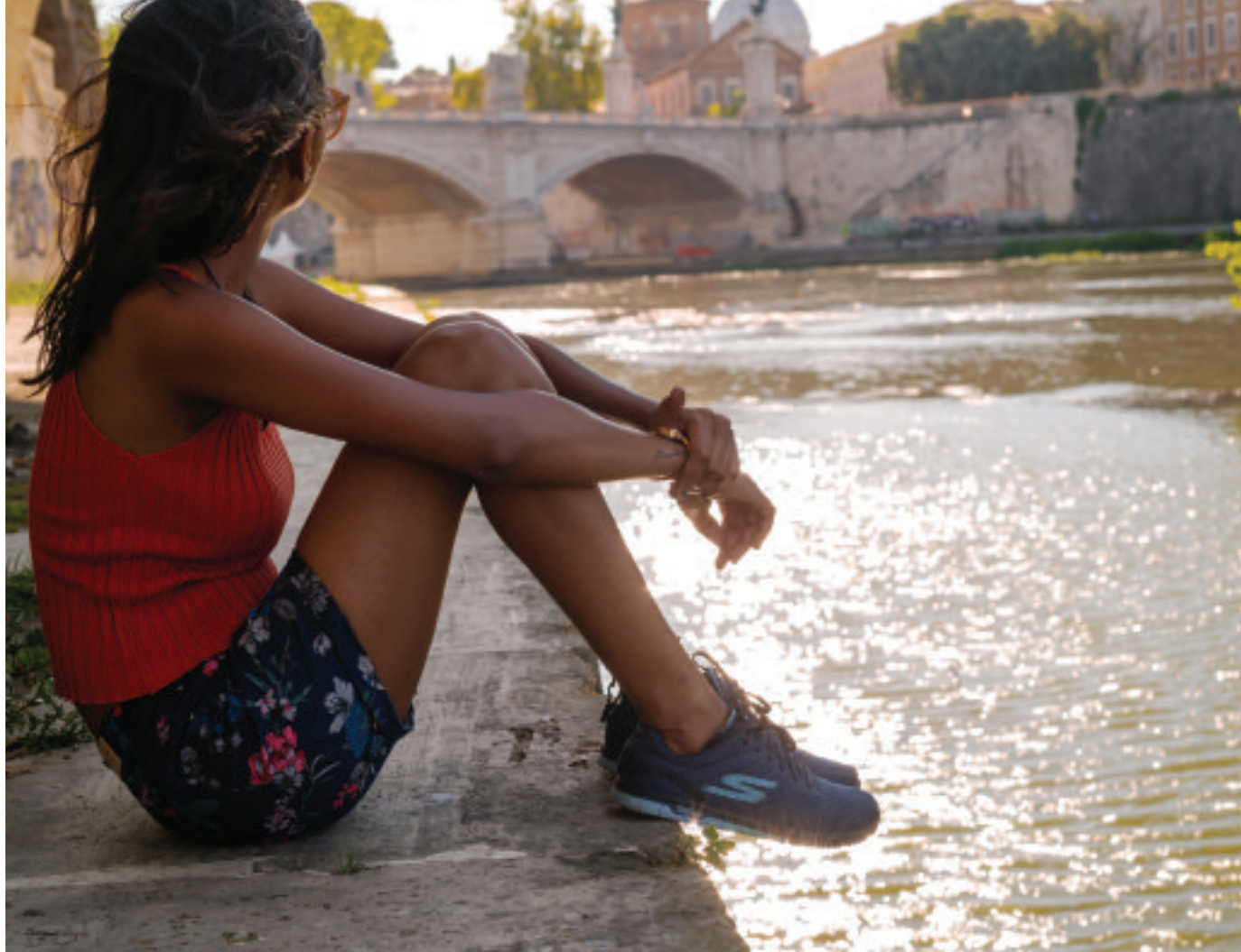
A solo traveller admires the view along the Tiber in Rome on a warm summer day.