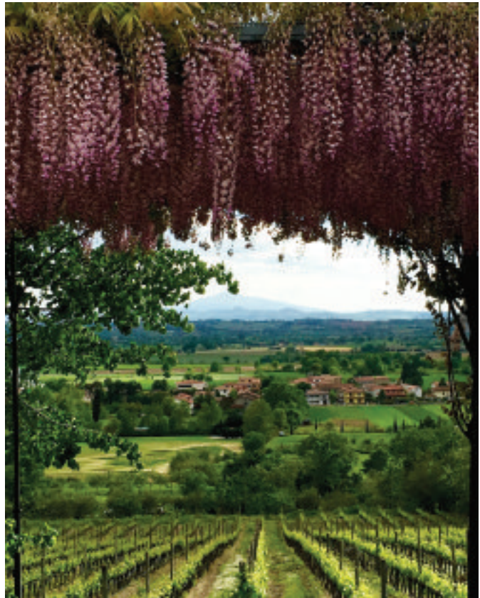
Wisteria frames a vineyard under the Tuscan sun.