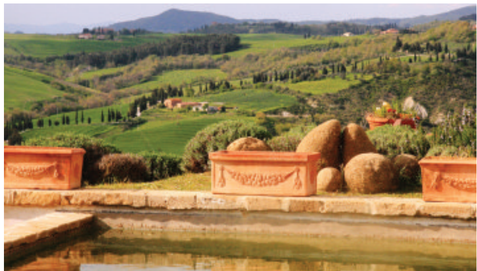
Tuscany’s breathtaking pastoral landscape in April.