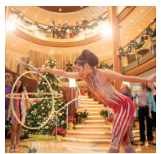
Celebrity Cruise Lines