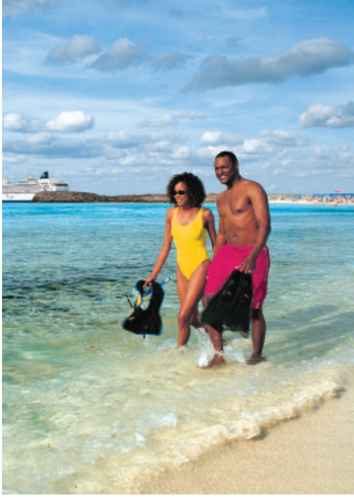
above Norwegian Breakaway, above right Great Stirrup Caye, Bahamas Norwegian Cruise Lines,

beautiful holiday decorations (including a menorah), and the staff go all out, including presenting a carolling show over the Christmas holidays. A Windstar New Year's Eve tradition is for the oldest crew member to ring out the New Year and the youngest to ring in the new. Passengers also are treated to a New Year's Eve party with a champagne toast, live music, and an official countdown by the captain.