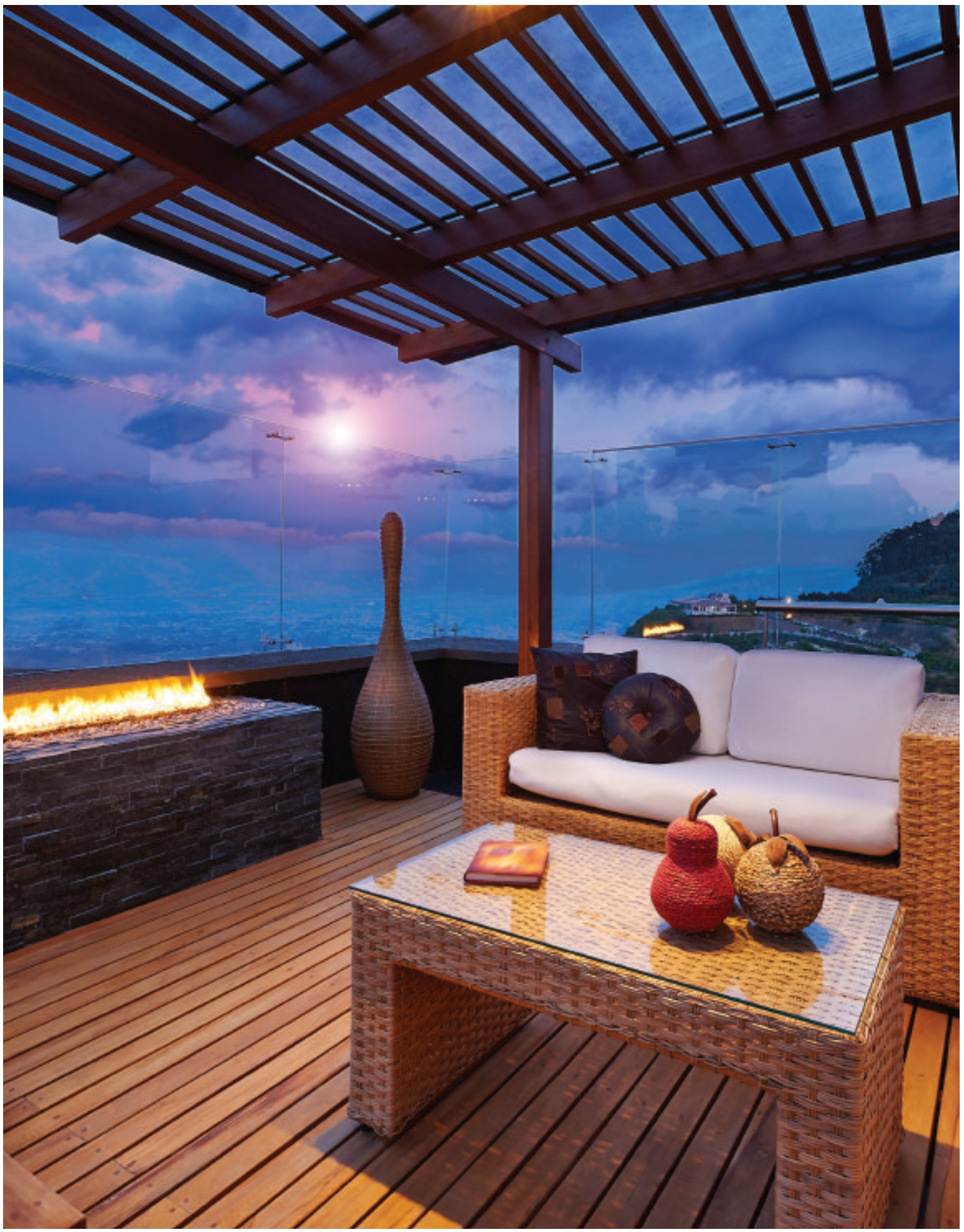
mississauga.com/goodlifemagazine | SUMMER 2019